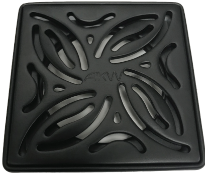
Swirl Pattern Drain for Tile